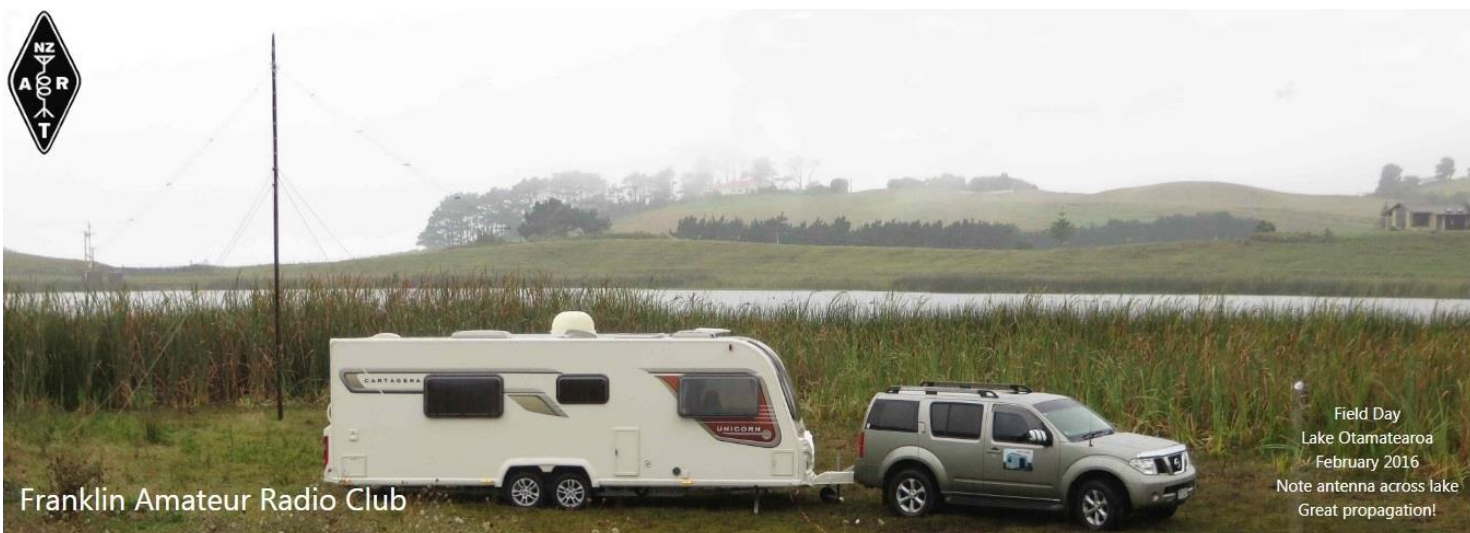
Franklin Amateur Radio Club